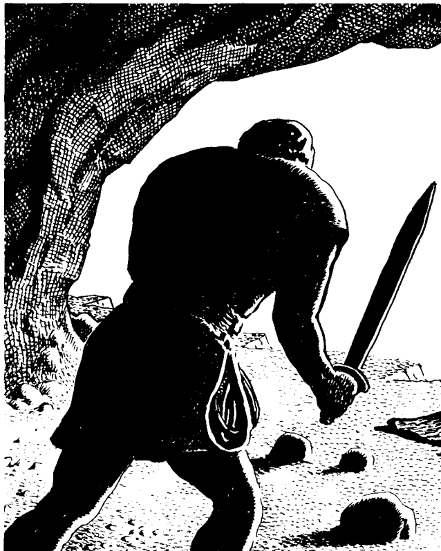
David had the opportunity to kill evil King Saul in a cave, but refused because of his respect for God's anointed.

A few minutes later, much to the surprise of his men, David left the cave and yelled after Saul, "My lord, the