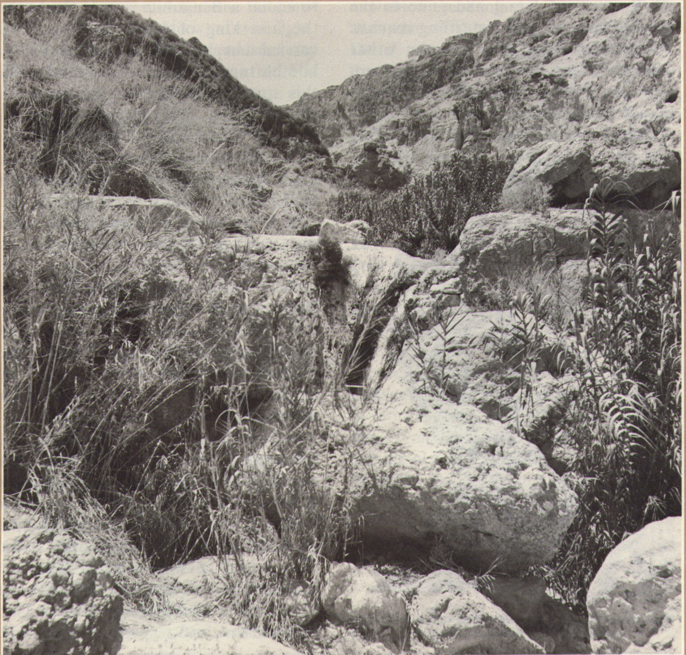
David Prepares To Be King