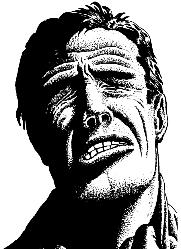
Because of Saul's disobedience to God, he became unhappy, miserable and depressed.

Saul ordered him to play. David played the most restful song he could