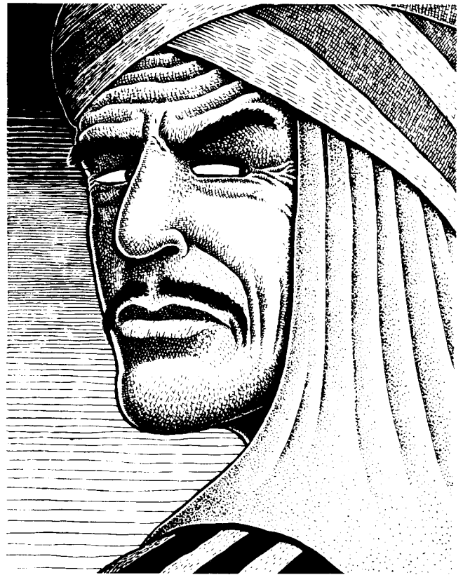
Doeg, the Edomite, mercilessly killed 85 priests of God at Saul's command.

"Those who help traitors like David are guilty of treason. Slay them!" Saul ordered. But the soldiers feared God and refused to carry out the King's command. Saul became enraged. "Doeg, you slay them!" Doeg, unlike the Israelites, did not fear God. He drew his sword and killed 85 priests of God that day. Then, at Saul's command, Doeg left for Nob to destroy the priests' families and livestock.