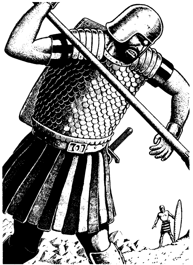
Goliath's shield-bearer stared in disbelief as the stone from David's sling struck the giant between the eyes, killing him instantly!

“And all this assembly shall _____ that the _____